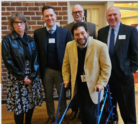
2025 MACS Legislative Breakfast

He also advocated for the DDA Rent Subsidy Program (DDARSP), which helps Marylanders with disabilities rent homes by limiting rent and utilities to 30% of household income. The program is a partnership between DDA, MDOD, and DHCD.